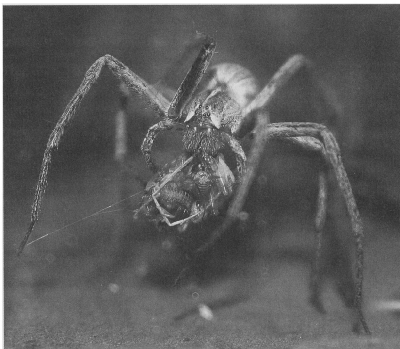
PLATE 1. Predator-prey interaction between the lycosid spider Pisaura mirabilis and the cricket Gryllus assimilis .