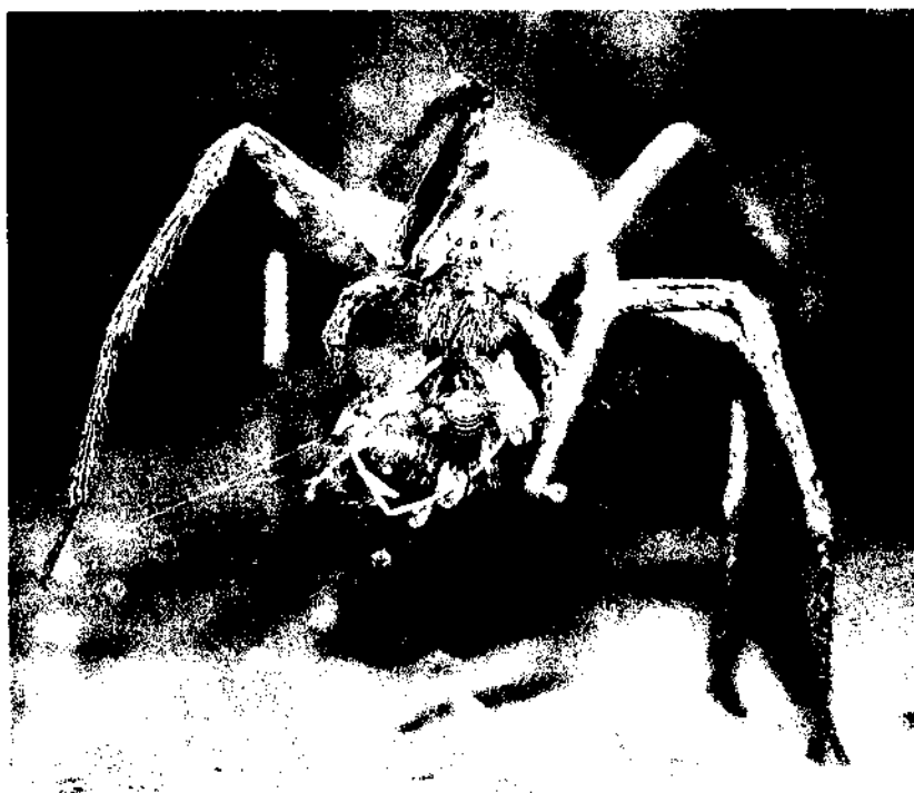
PLATE 1. Predator-prey interaction between the lycosid spider Pisaura mirabilis and the cricket Gryllus assimilis .